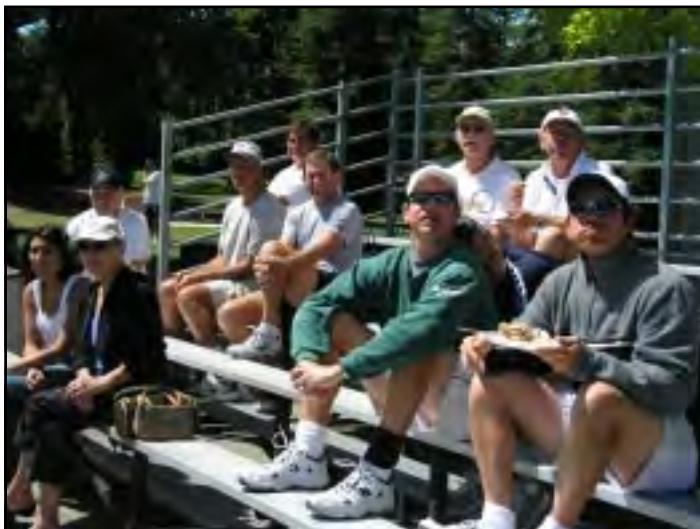
The crowd watches some exciting tennis on Court 4.