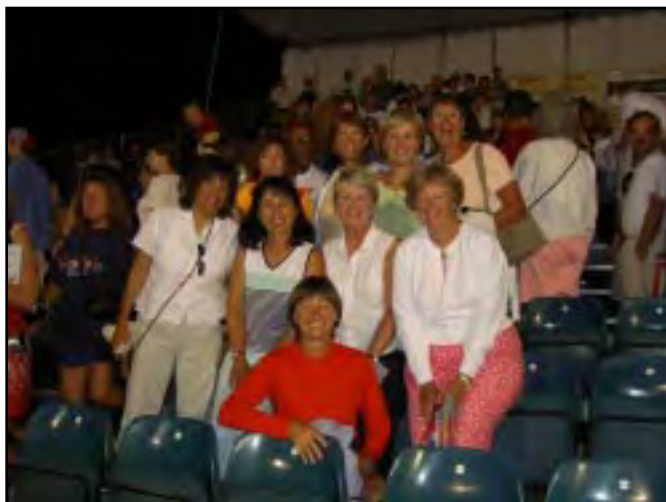
WCRC members enjoy an evening of fun watching the Sacramento Capitals team tennis match.