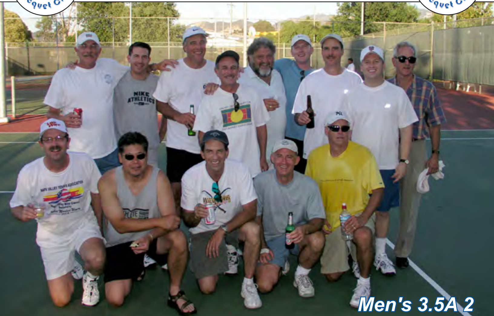
Men's 3.5A 2