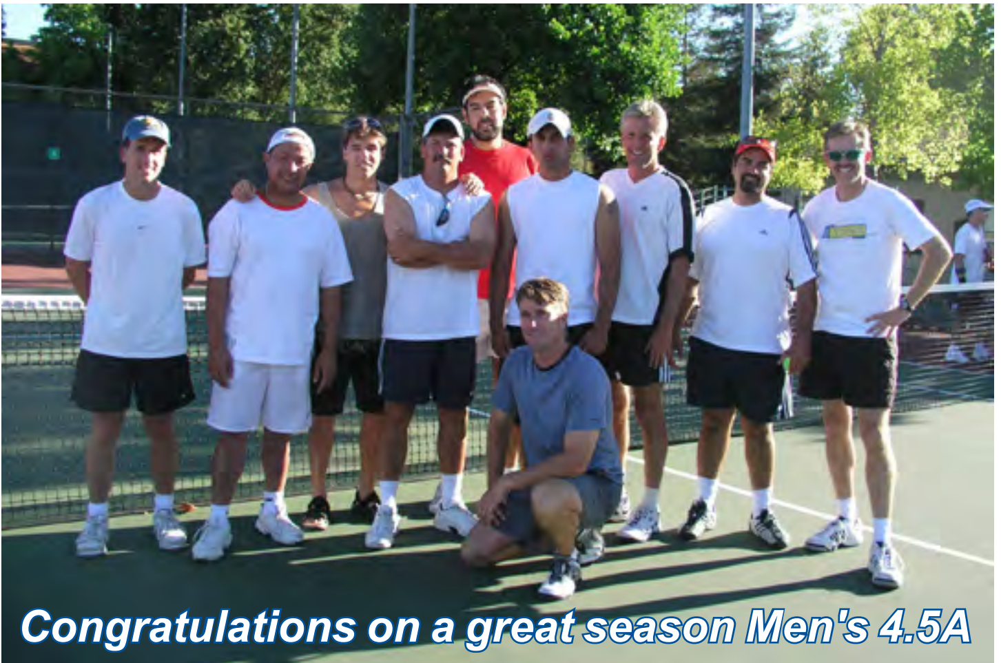
Congratulations on a great season Men's 4.5A

PRESORTED STANDARD U.S. POSTAGE PAID Walnut Creek, CA Permit No. 432