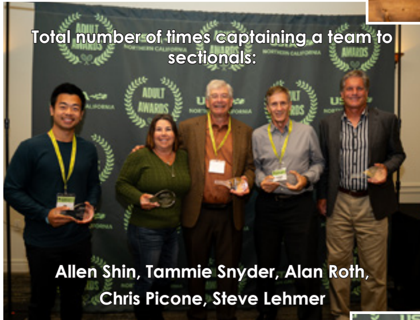
Total number of times captaining a team to sectionals: