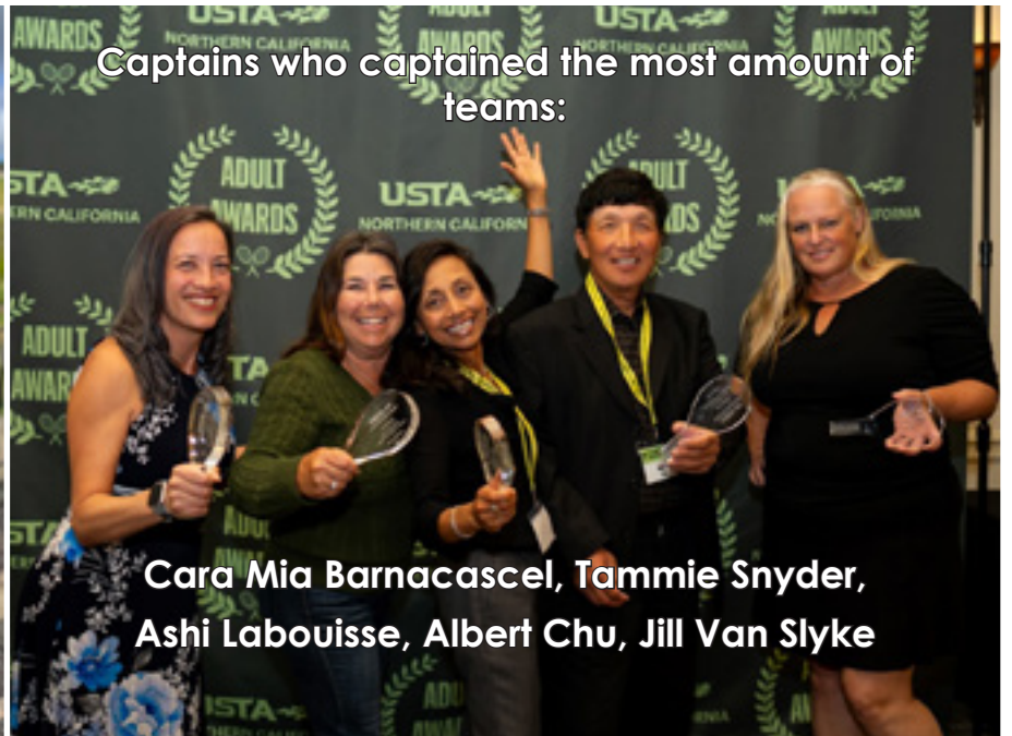
Captains who captained the most amount of teams: