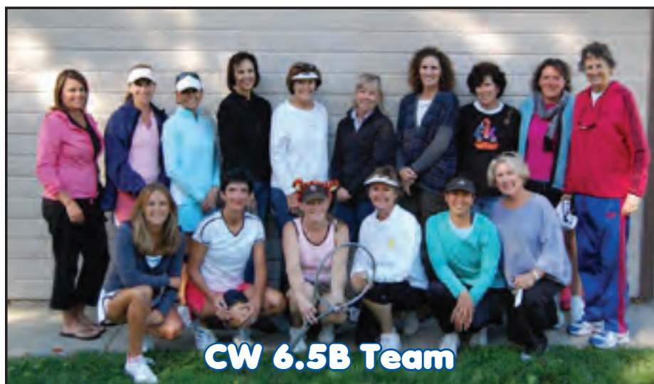
CW 6.5B Team

Our Walnut Creek 6.5 B team ended the regular season in second place with an 8 win and 2 loss record which qualified us for the playoffs. We lost out in the first round to Diamond Hills in a very tightly played thriller match, losing 2 to 1, with the final determining match going three full sets and a 7 point tie breaker! Can't get much more thrilling than that! Great effort and a wonderful supporting group of teammates.