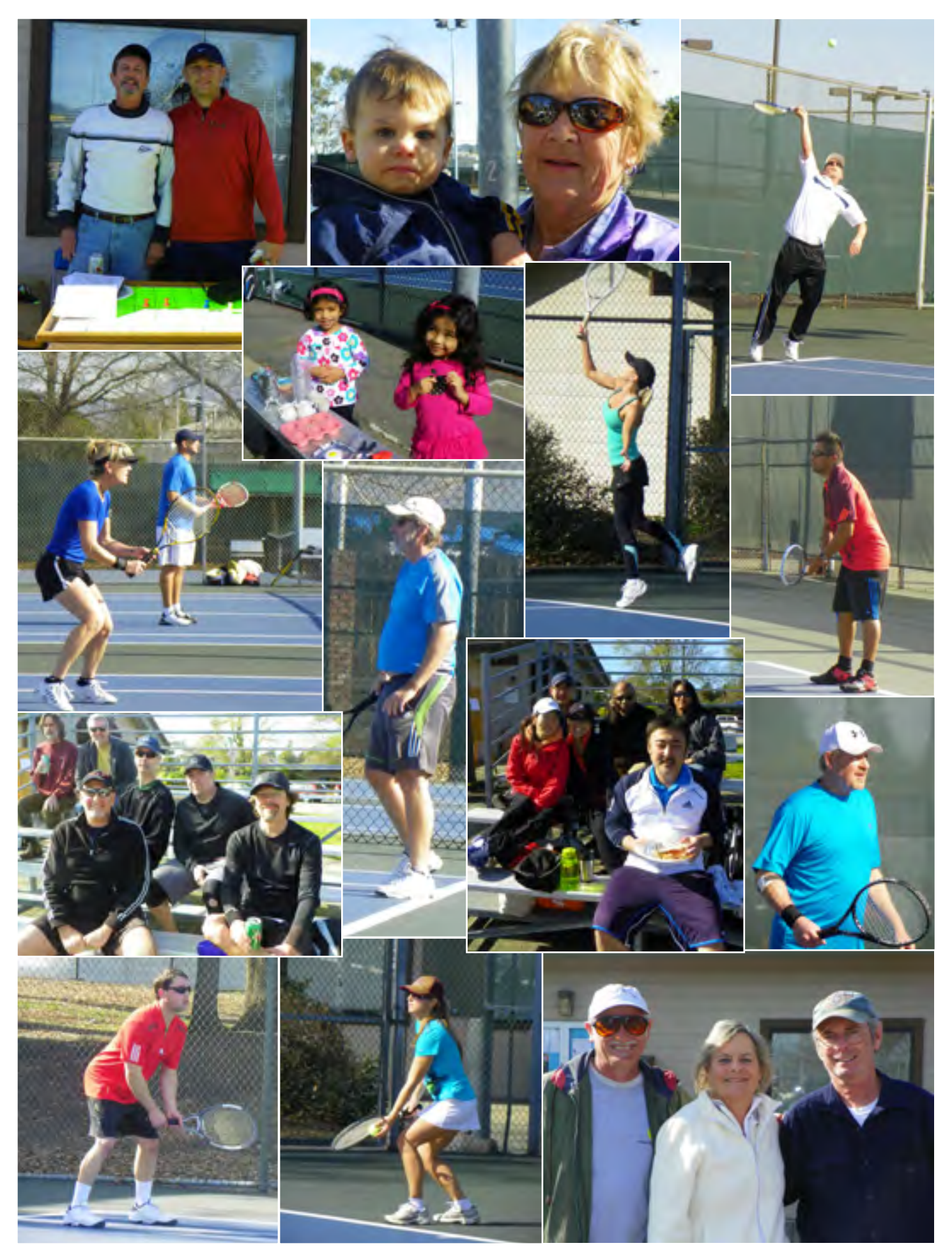
The Court Reporter • February 2012