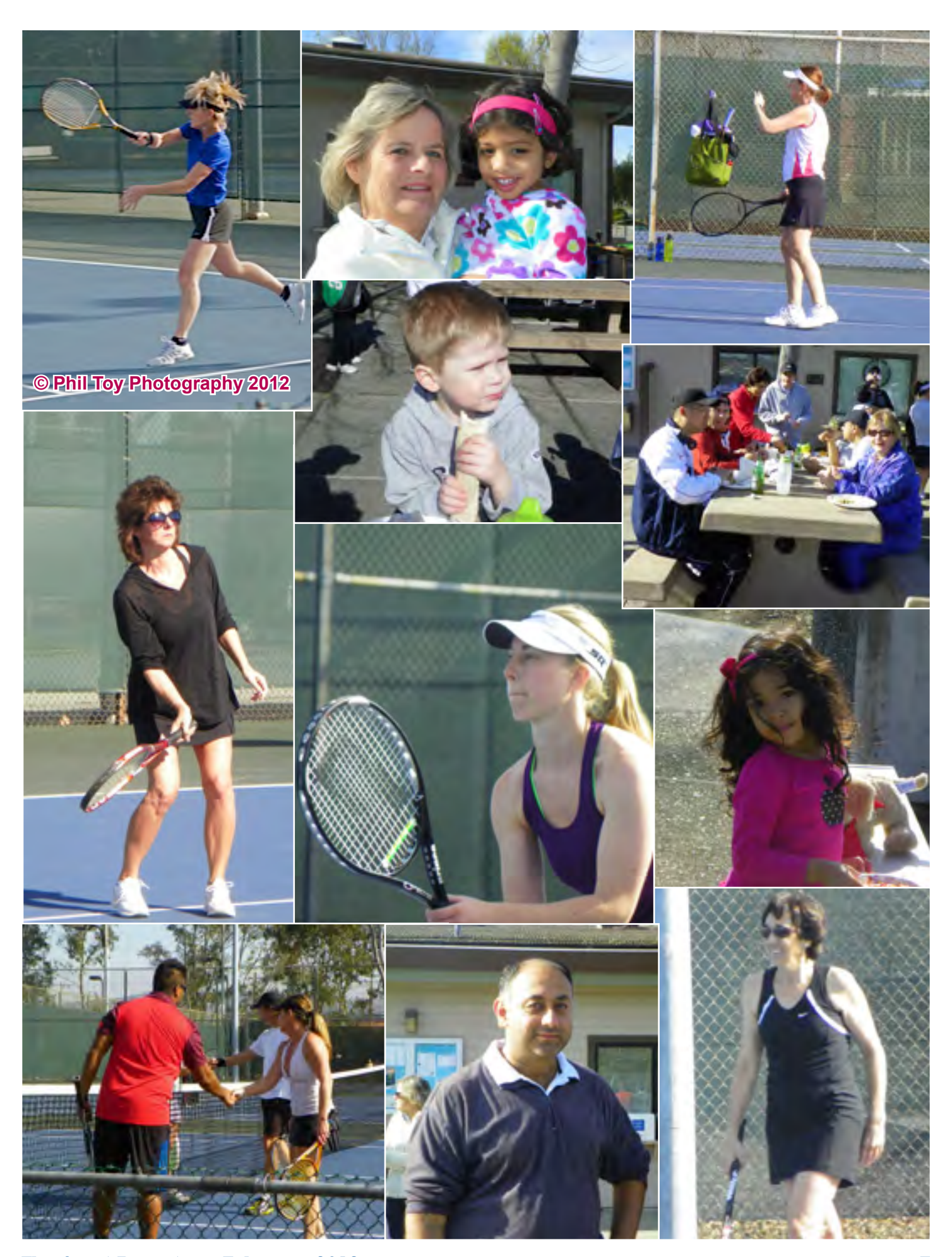
The Court Reporter • February 2012