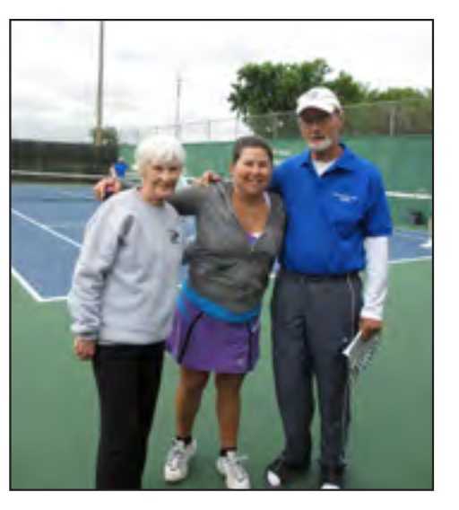
The Court Reporter • λugust 2012