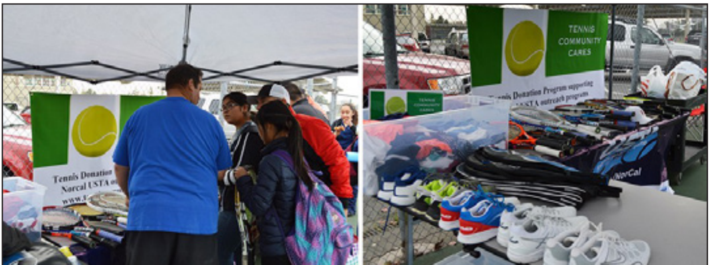
Picture on the left: Mt Diablo HS tennis players choosing their new racquet.

The Giving Tuesday campaign was truly a team effort and wouldn’t have been as successful if it weren’t for everyone’s generosity. Because the campaign was so successful, another High School will benefit from all the donation and will be chosen at a later time.