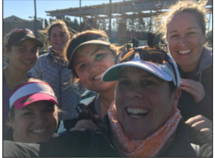
Selfie of happy winners!!!!

Then in the final playoff match at Diamond Hills, our gals once again took a sweep and won that match also 3 to 0! Great playing ladies! Our entire team contributed to getting us to the playoffs as they worked hard all season toward that goal. The title was claimed outright by our gals !!