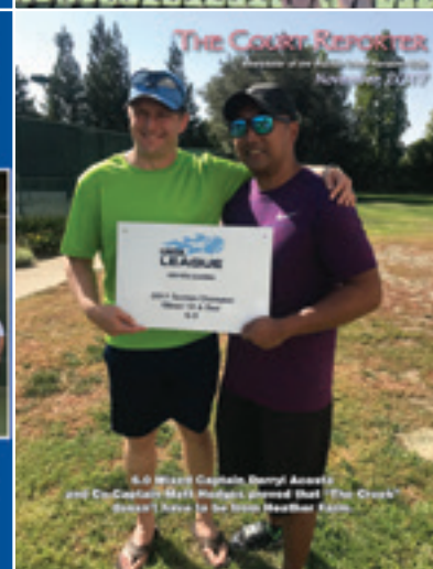
THE COURT REPORTER Newsletter of the Walnut Creek Racquet Club November 2017