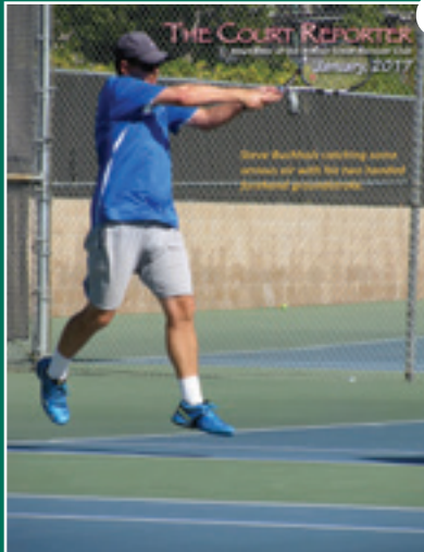
THE COURT REPORTER Newsletter of the Walnut Creek Racquet Club January 2017