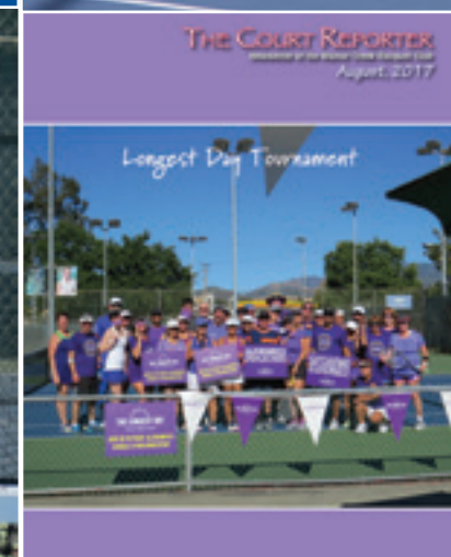
THE COURT REPORTER Newsletter of the Walnut Creek Racquet Club August 2017