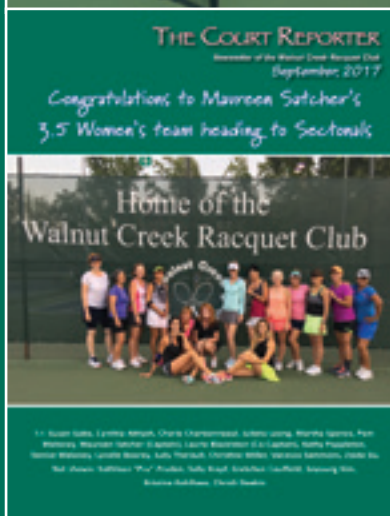
THE COURT REPORTER Newsletter of the Walnut Creek Racquet Club September 2017