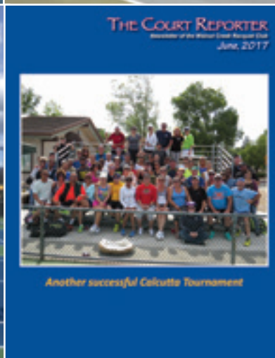
THE COURT REPORTER Newsletter of the Walnut Creek Racquet Club June 2017