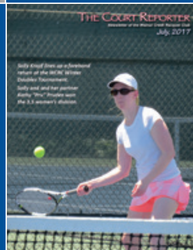
THE COURT REPORTER Newsletter of the Walnut Creek Racquet Club July 2017