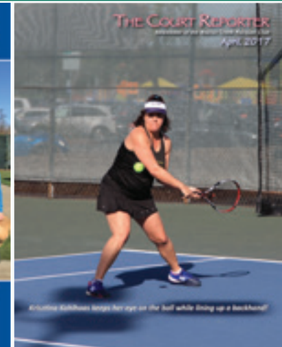
THE COURT REPORTER Newsletter of the Walnut Creek Racquet Club April 2017