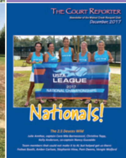
THE COURT REPORTER Newsletter of the Walnut Creek Racquet Club December 2017