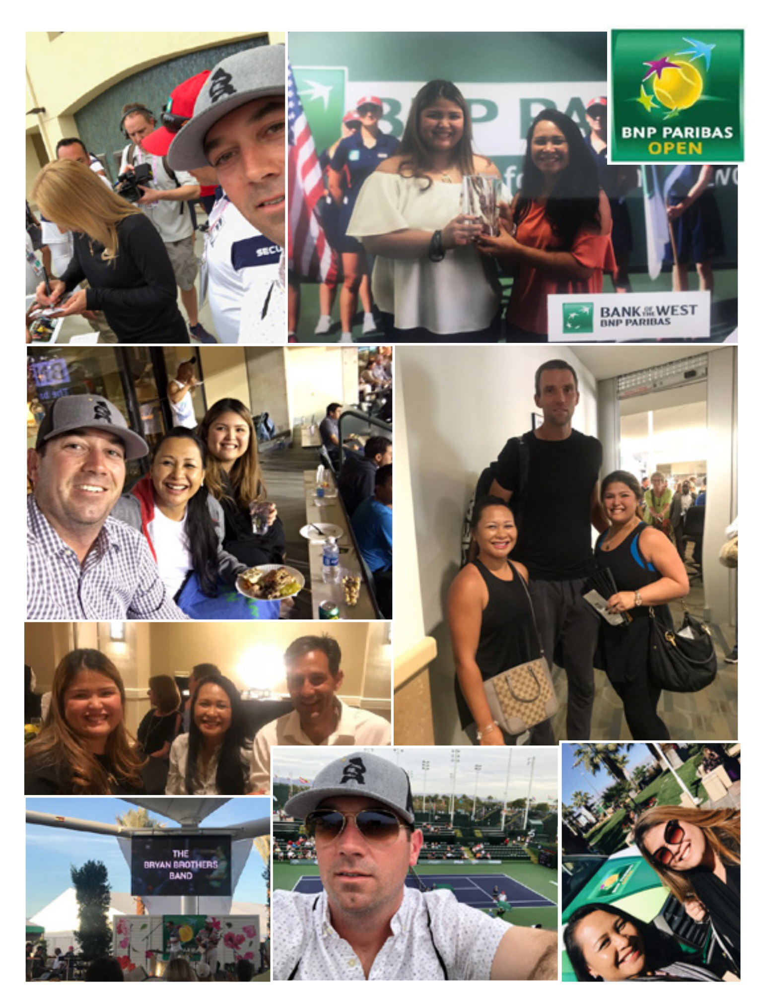
The Court Reporter • April 2018