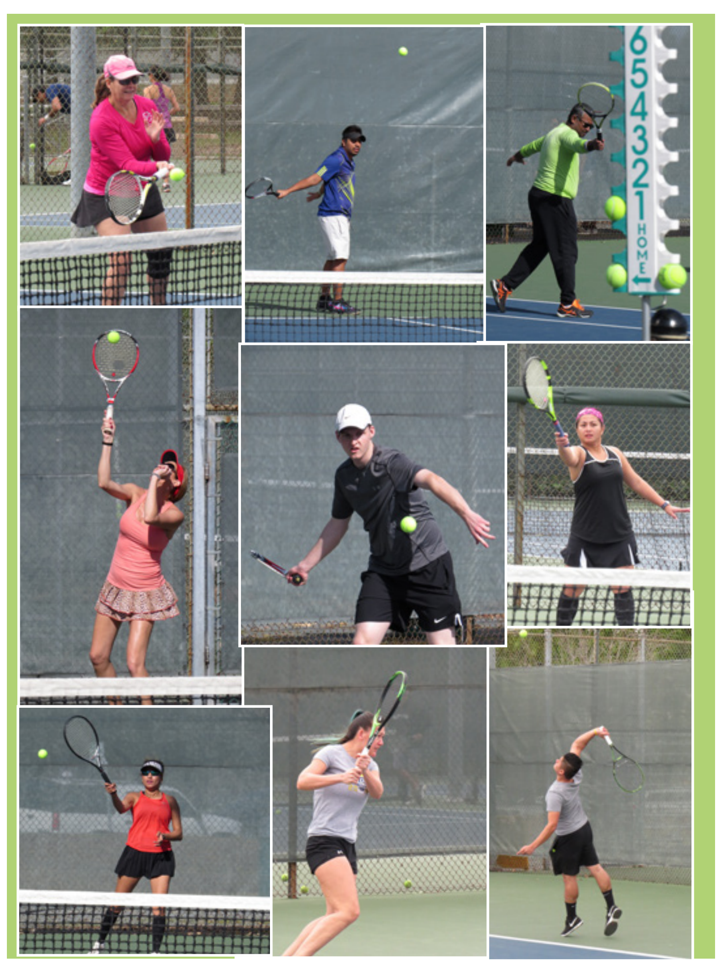
The Court Reporter • April 2018