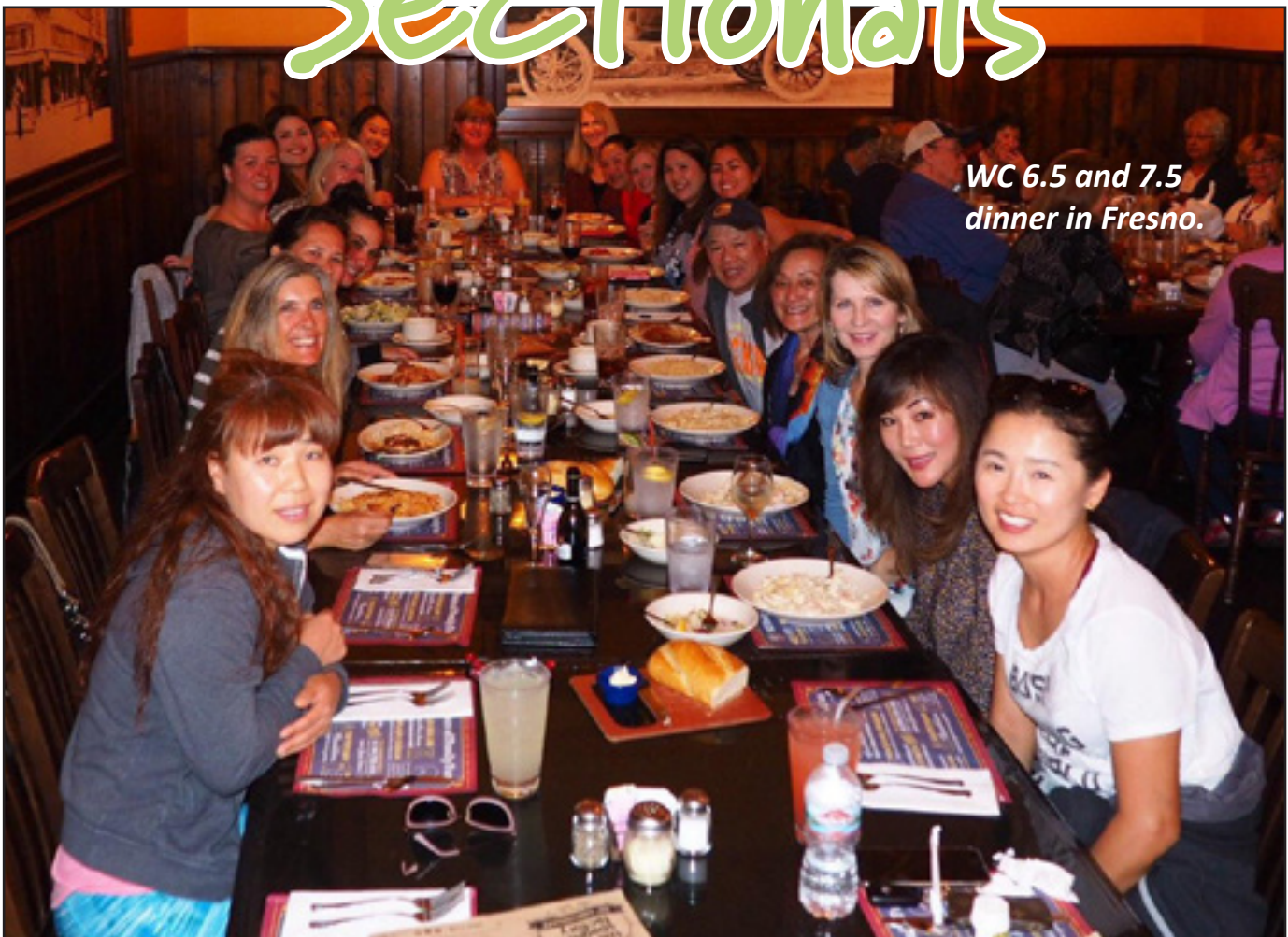
WC 6.5 and 7.5 dinner in Fresno.