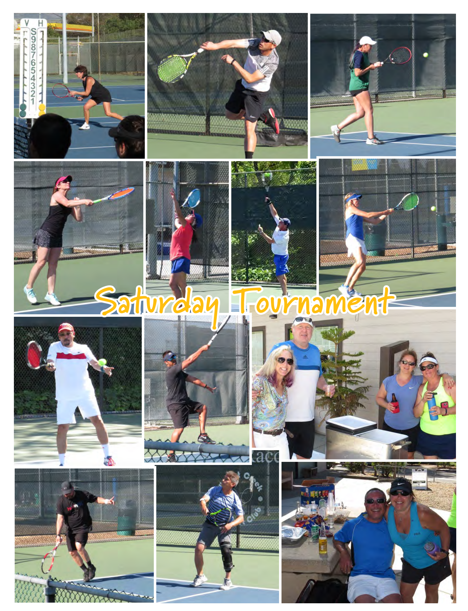
The Court Reporter • June 2019