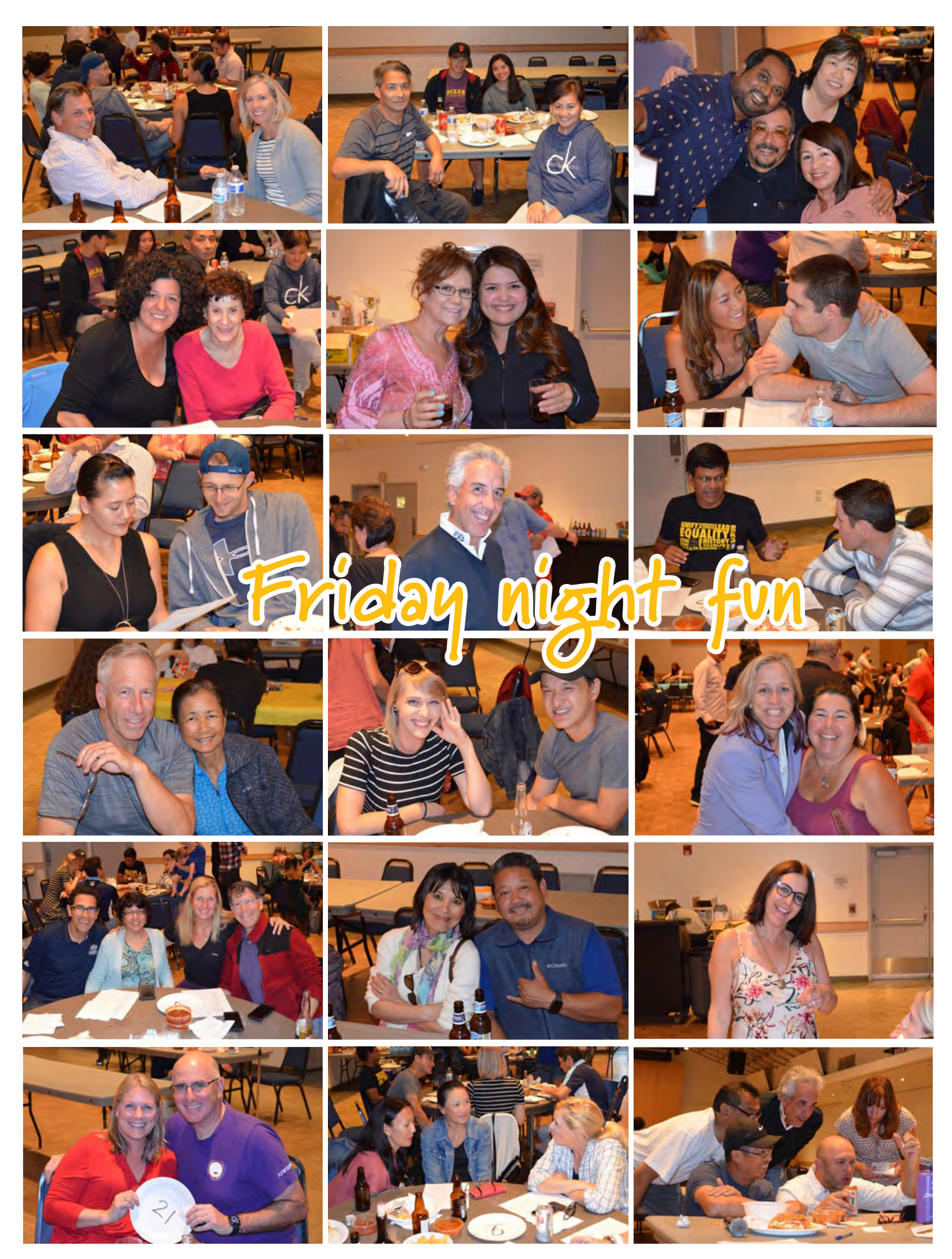
The Court Reporter • June 2019