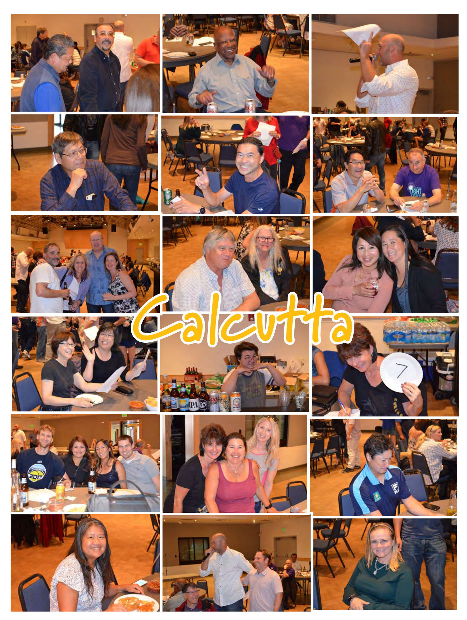
The Court Reporter • June 2019