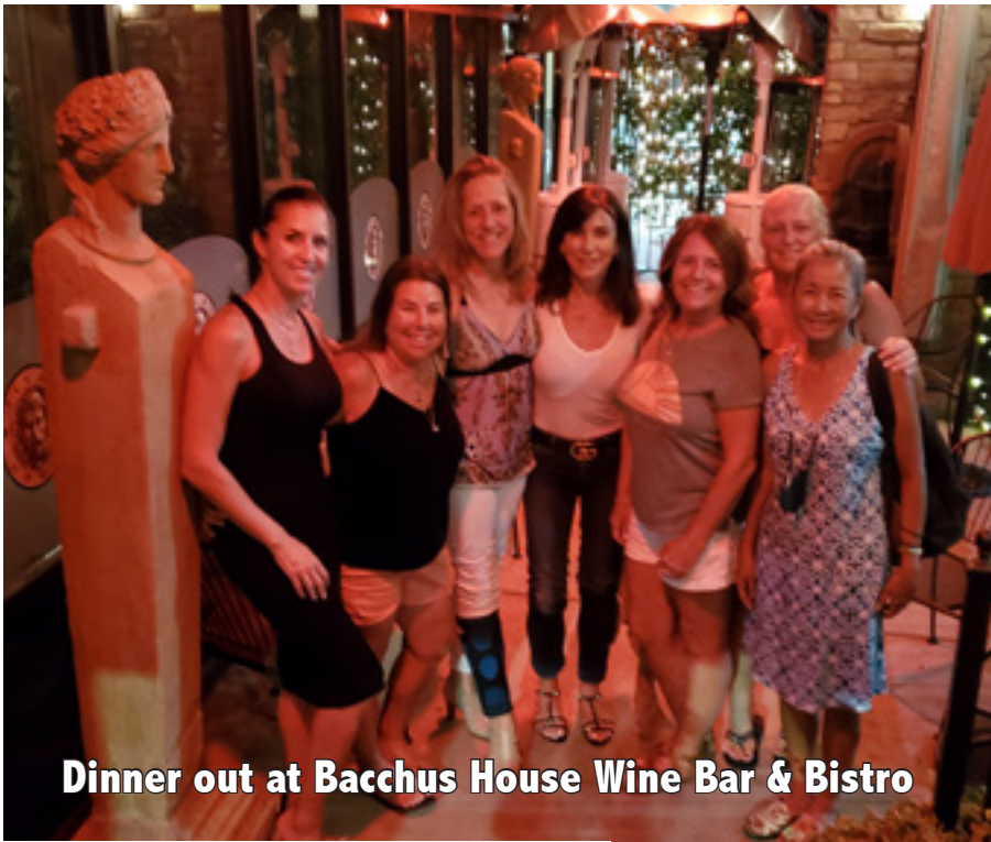
Dinner out at Bacchus House Wine Bar & Bistro