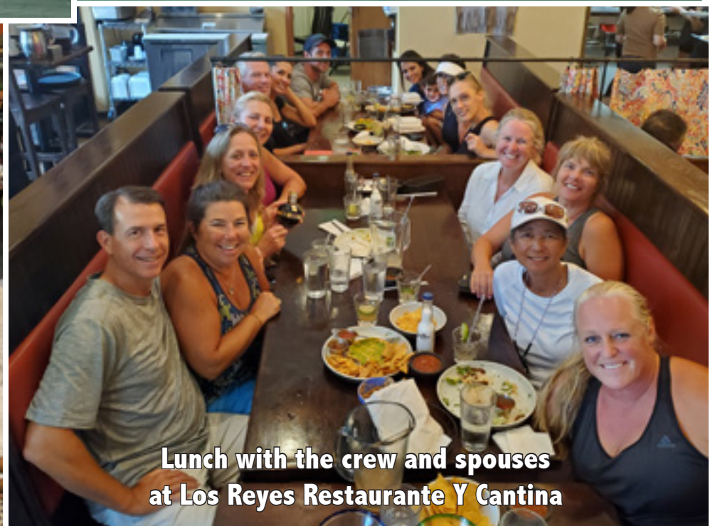
Lunch with the crew and spouses at Los Reyes Restaurante Y Cantina