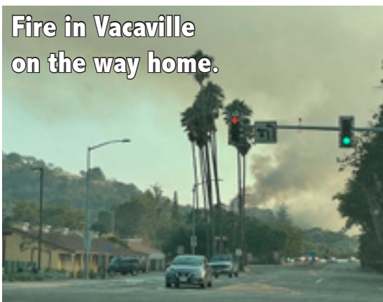
Fire in Vacaville on the way home.