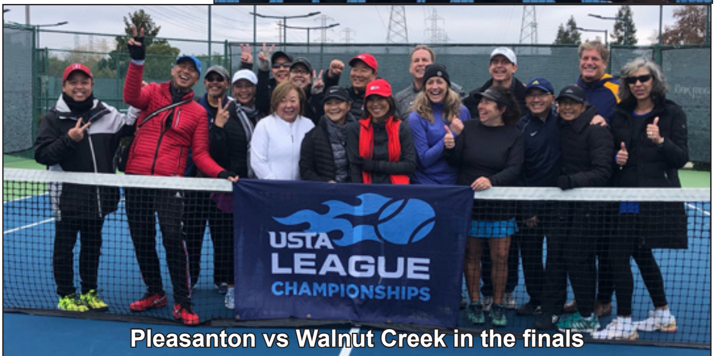
Pleasanton vs Walnut Creek in the finals