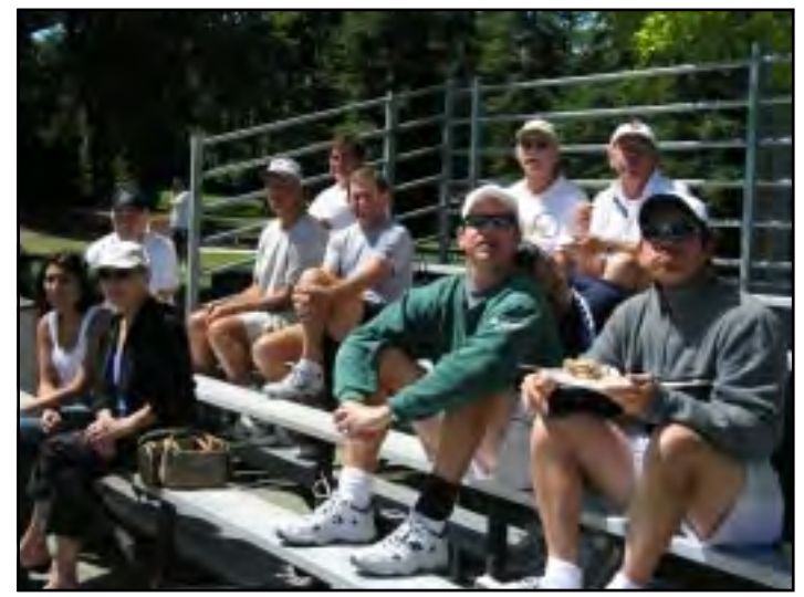
The crowd watches some exciting tennis on Court 4.